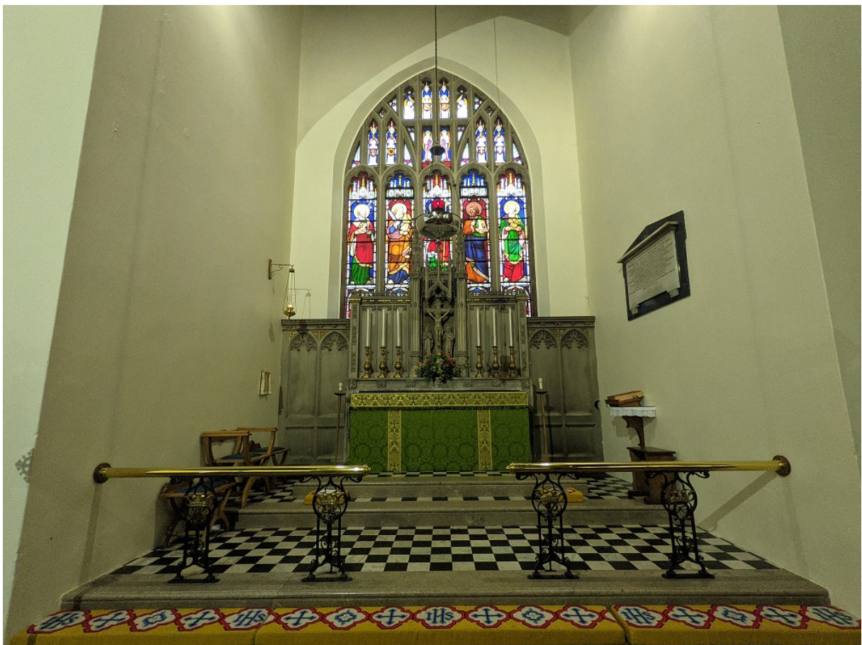
Fig. 4 | Church Photographs (4.1 + 4.2 Interior)