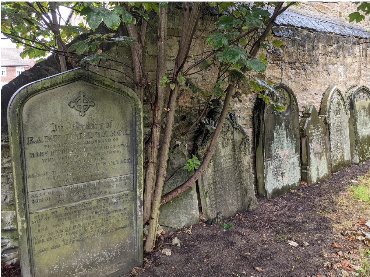
Fig. 5 | Church Photographs (5.1 + 5.2 Church Grounds)