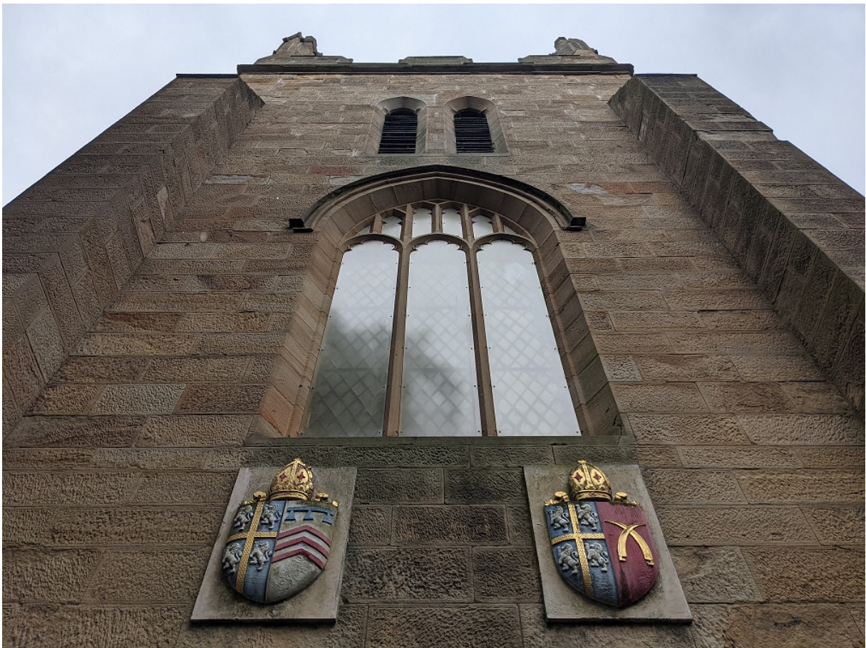
Fig. 3 | Church Photographs (3.1 + 3.2 Exterior)