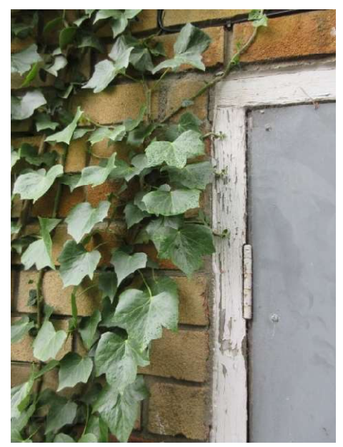
Ivy at Upper Hall