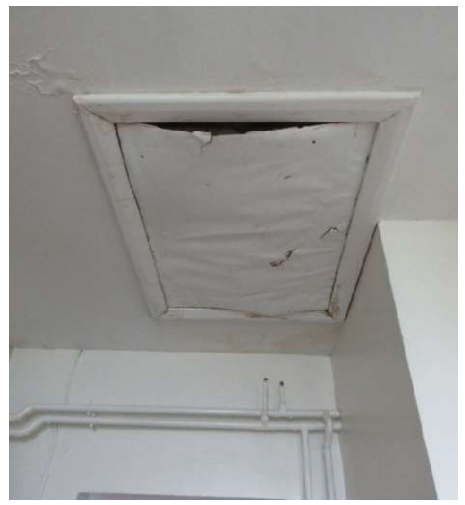
Damaged hatch at Vestry