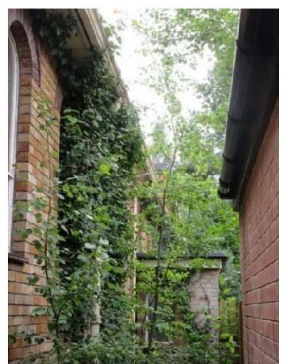
Saplings in the strip of land at W