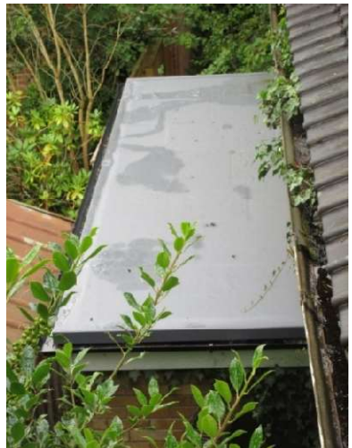
Ivy in gutter over Baptistery