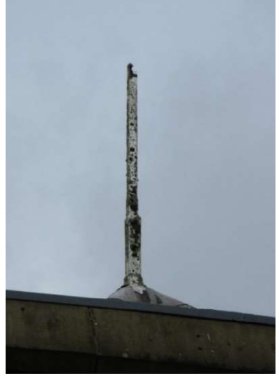
Former cross on Tower now rusting away