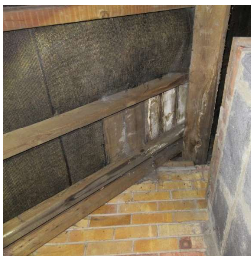
Vestry S side

22. The Nave SW corner where the higher Hall dormer abuts the church roof (accessible from the fire escape) was covered in flashband before 2018. Lead cladding would be desirable but interference from the escape is too easy. New battens and an end tile with slate undercloak OR tiles with dry verge lapped over a new upvc fascia might be a permanent solution.