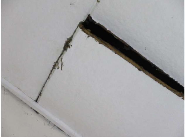
Tile loose near organ

59. Vestries have plaster on softwood joists with thin insulation quilt over part only. Sound except hatch and adjacent plaster damaged by roof leak over.