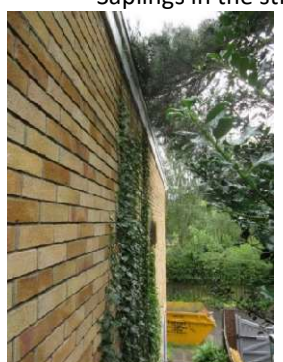
Ivy at Upper Hall