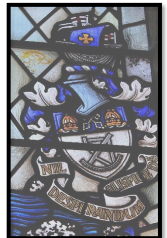
The City Crest from the East Window

We are committed to the four diocesan priorities of Challenging Poverty, Energising Growth, Caring for God's Creation and Engaging with Children, Youth and Young Adults and want to continue to grow through them. As we continue the journey on which Christ has called us, we are looking for a new Canon Provost to walk that journey with us in leadership, discernment, and witness. We pray that you will read and discern whether God might be calling you to walk that next part of our journey with us.