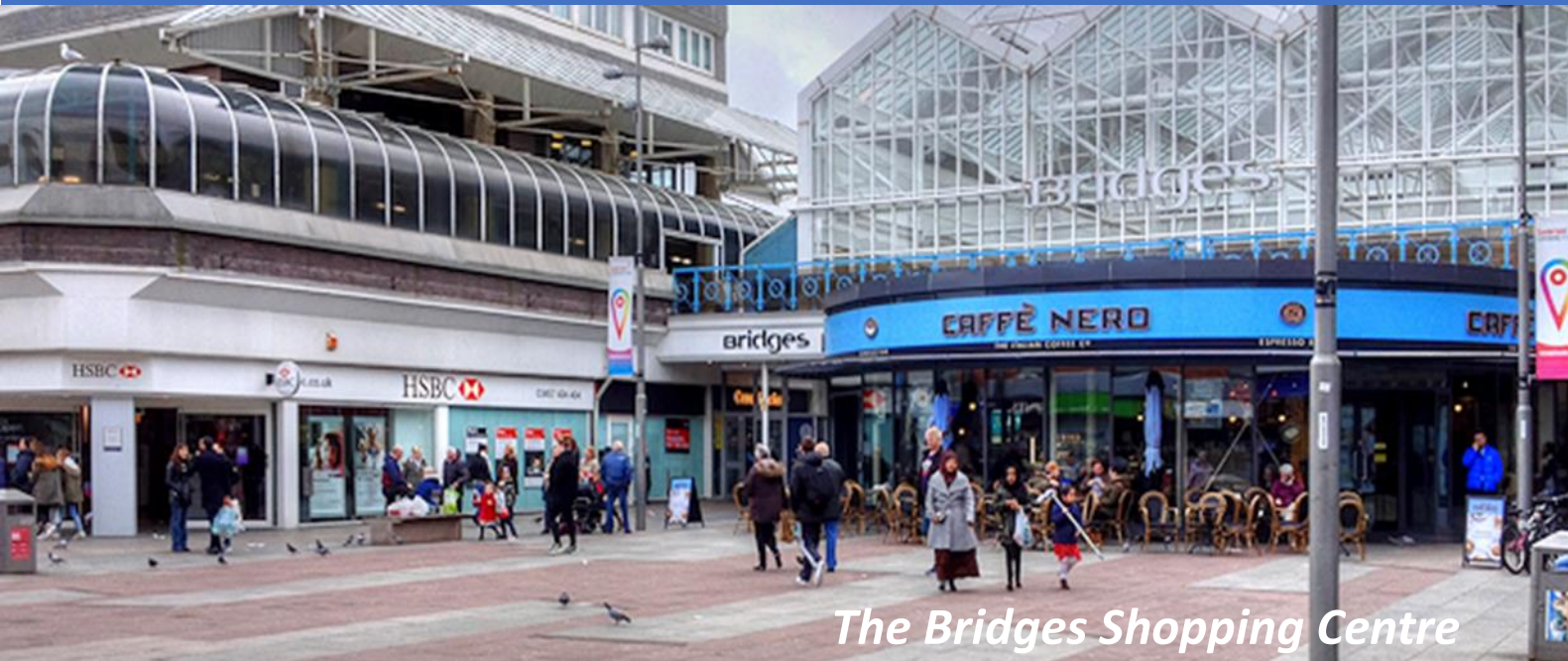
The Bridges Shopping Centre

Sunderland Minster is a church set in the heart of the City of Sunderland in the Wearmouth Deanery within the Diocese of Durham. We seek to be 'open to God and open to all' as we worship God, serve our city in the name of Jesus Christ while being open to where the spirit is leading us.