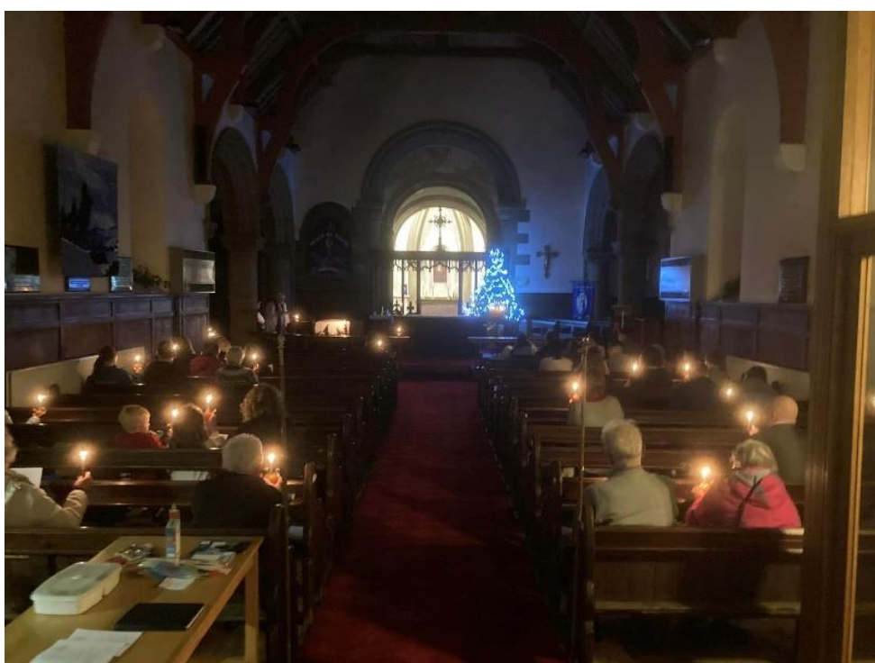
Christingle Service Christmas Eve 2023

In addition to our weekly rhythm of worship, we celebrate special seasonal services such as Christingle and Christmas services, Holy Week and Easter.