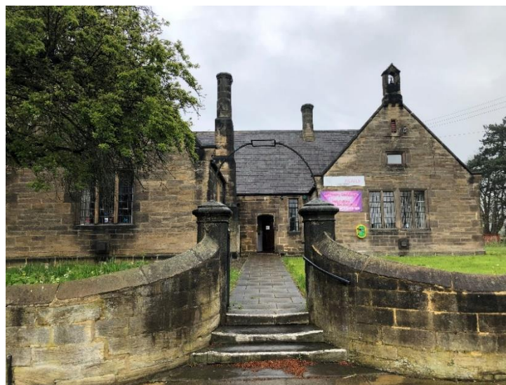
The Church Hall

There is a gated carpark behind the church hall. The large carpark in front of the church is maintained by Gateshead Council.