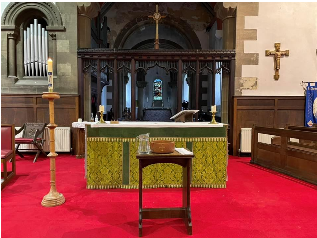
St. John's Church set up for a Baptism Service

The PCC and congregation seek to work with a priest who can help us grow and develop our mission and ministry within Birtley Parish.