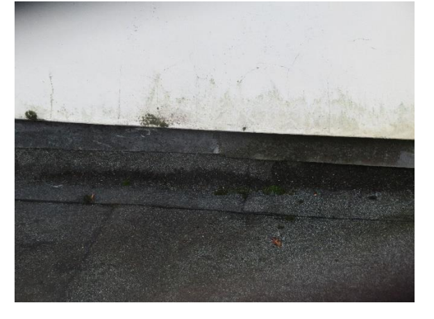
Photo 14, Example of vertical cracking over drip bead over flat roof

2.4.4 Vertical cracking observed above drip beads over flat roofs.