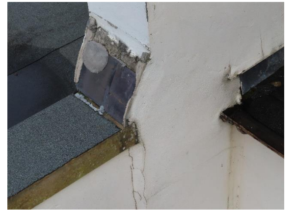
Photo 19, Cracked render and slipped slates at junction to vestry parapet

2.4.9 Vertical cracking at junctions of vestry parapet coping to buttress.