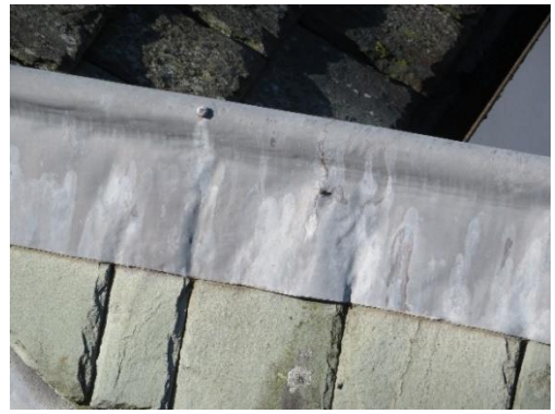
Photo 3, Example of holes and cracking to lead capping of buttress apex

damaged slates to the apexes. Locations on drawing R19/360/009