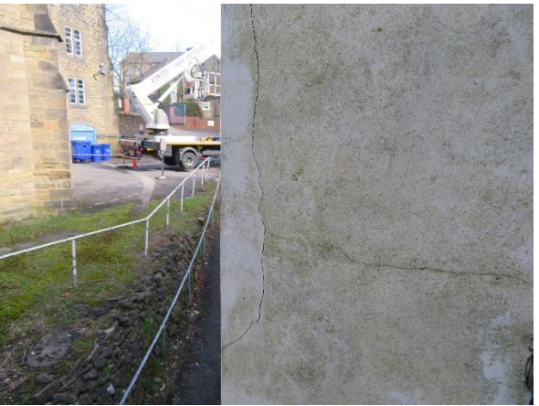
Photo 15, Example of vertical and horizontal cracking on buttresses

2.4.5 Vertical cracking and delaminating render to buttresses.