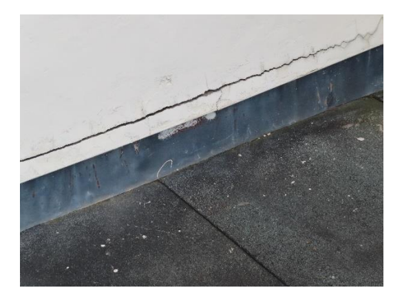
Photo 16, Example of horizontal cracking over lead flashing over flat roofs