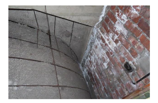
Photo 35 Salt deposits on inside brick face. Metal frame and mesh structure of barrel ceiling