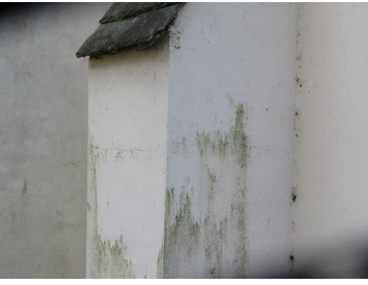
Photo 17, Regular spaced cracking to render on buttresses visible externally and internally