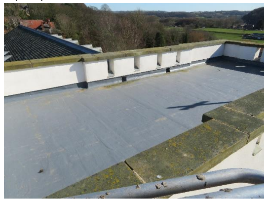
Photo 7, New plastic roof membrane to tower roof, gaps in the pointing to the coping stones.

2.1.7 The tower roof and stairwell roofs had recently been renewed and finished with a liquid plastic roof membrane. There were both in good condition.