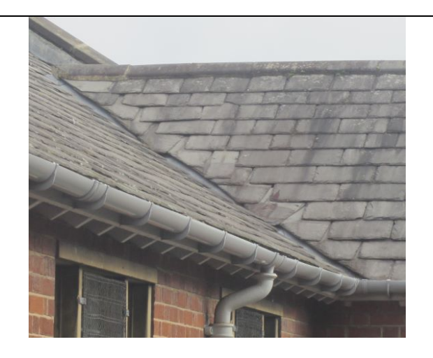
Slipped slates by valley of Organ Chamber roof