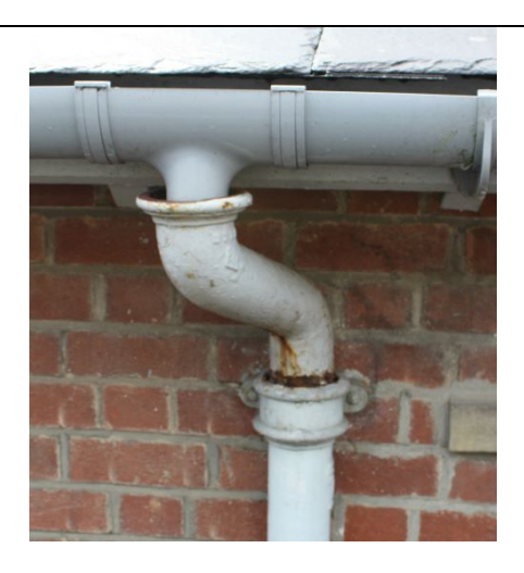
Rusting cast iron downpipe collars