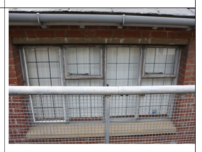
Rusting metal framed windows