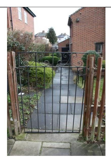
Misaligned west gate