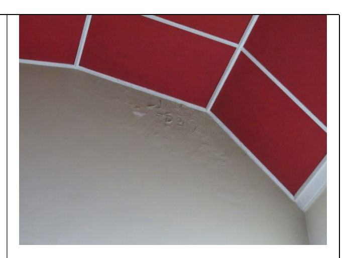
Chancel East wall – flaking paint through leak