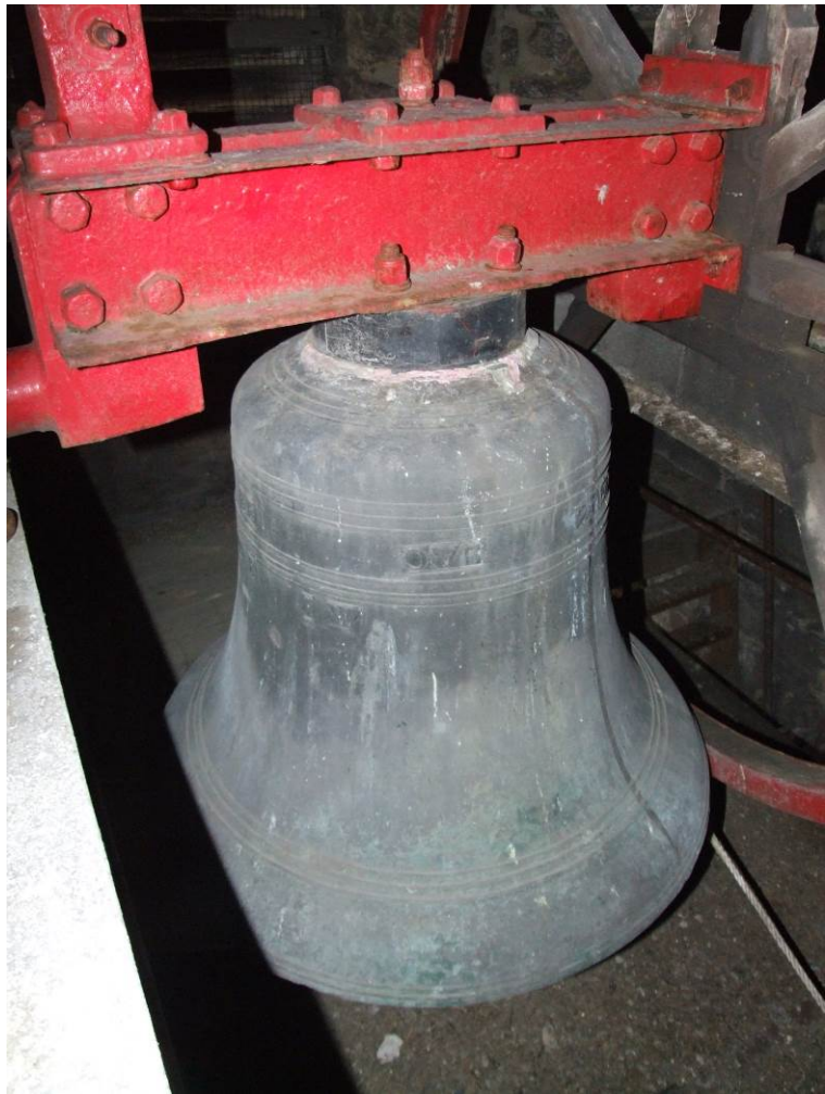
Surface corrosion to bell headstock