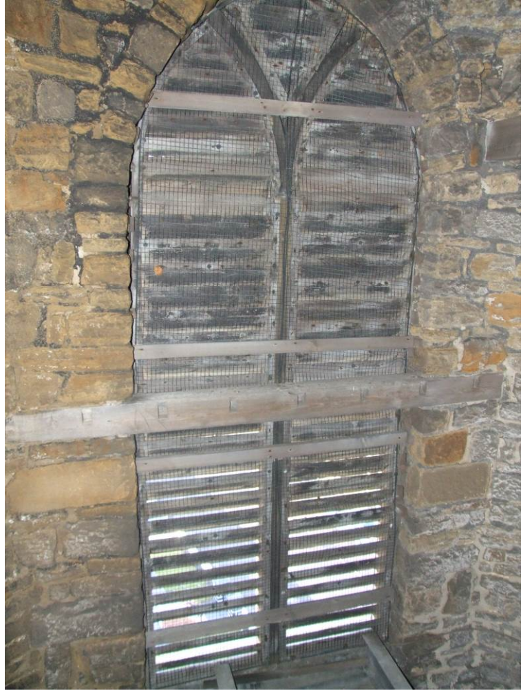
Bird mesh to bell chamber louvres