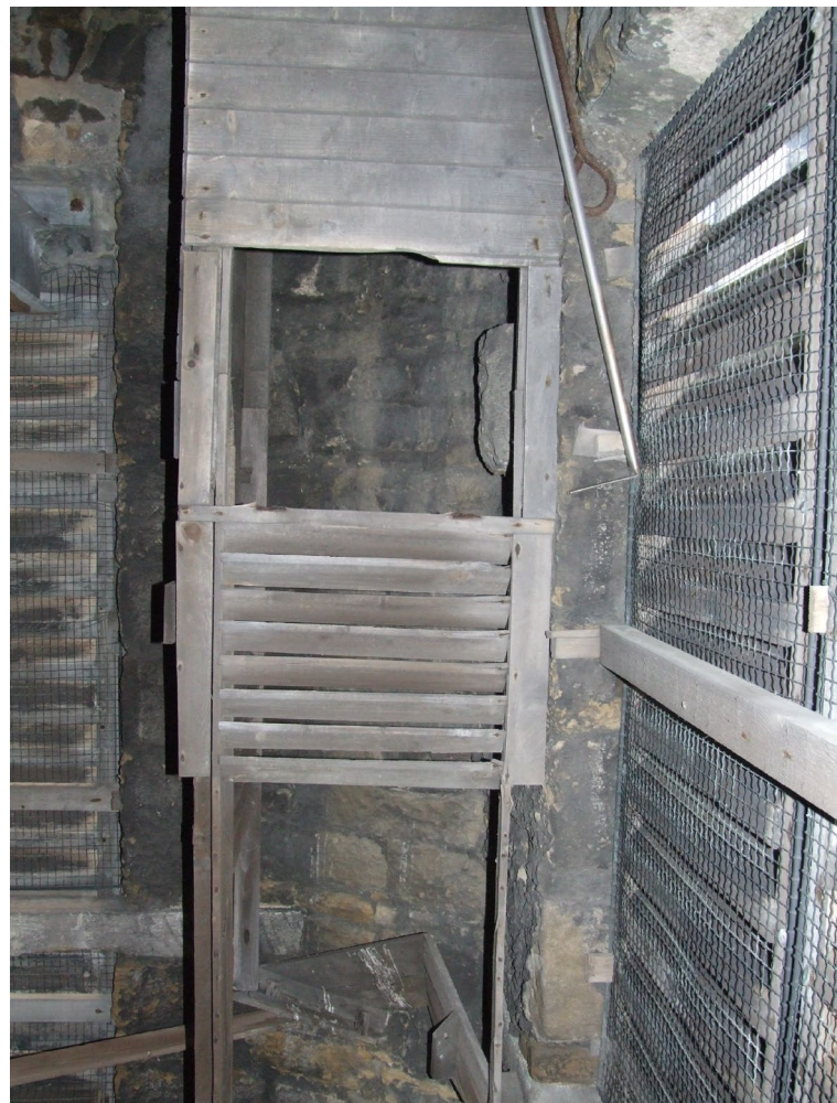
Redundant ventilation system