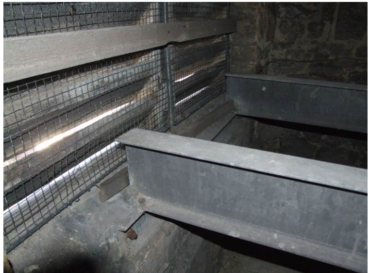
Bell frame wall support