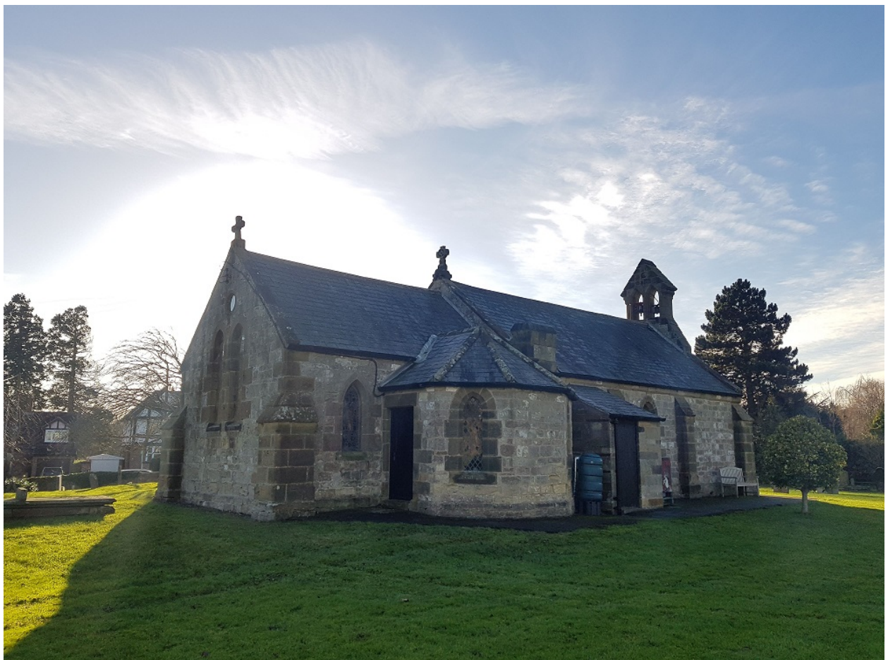
Fig. 3 | Church Photographs (3.1 + 3.2 Exterior)