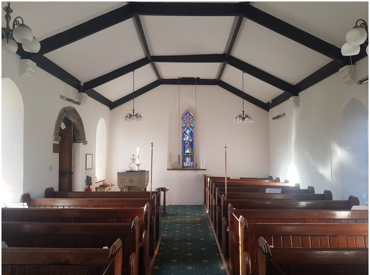
Fig. 4 | Church Photographs (4.1 + 4.2 Interior)