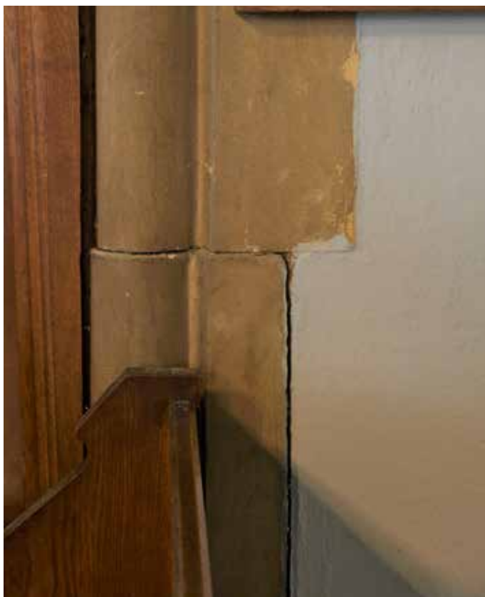
Chancel arch: historic displacement should be pointed up with lime mortar

There are numerous hairline cracks and opening of joints throughout the structure of the Church, but most appear to be historic. They should be monitored annually to check progress. Notable are the opening of joints in window sI (nave south elevation), the two windows of the south elevation of the chancel, and the opening to the west entrance door. Other areas to note are on the south elevation of the nave generally, joints in the main east window and the north window to the sanctuary. At the Chancel arch there are a small number of open joints to the underside of the voussoirs to the south side, and gaps in the joints of the hood mould. At the base of the arch there is a displaced column block, and there are historic cracks in the decorative column shaft. All open joints should be pointed up with soft lime mortar to allow monitoring of any future movement.