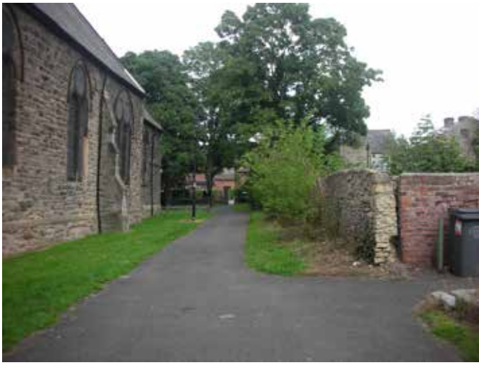
Southern and eastern boundary walls in poor condition