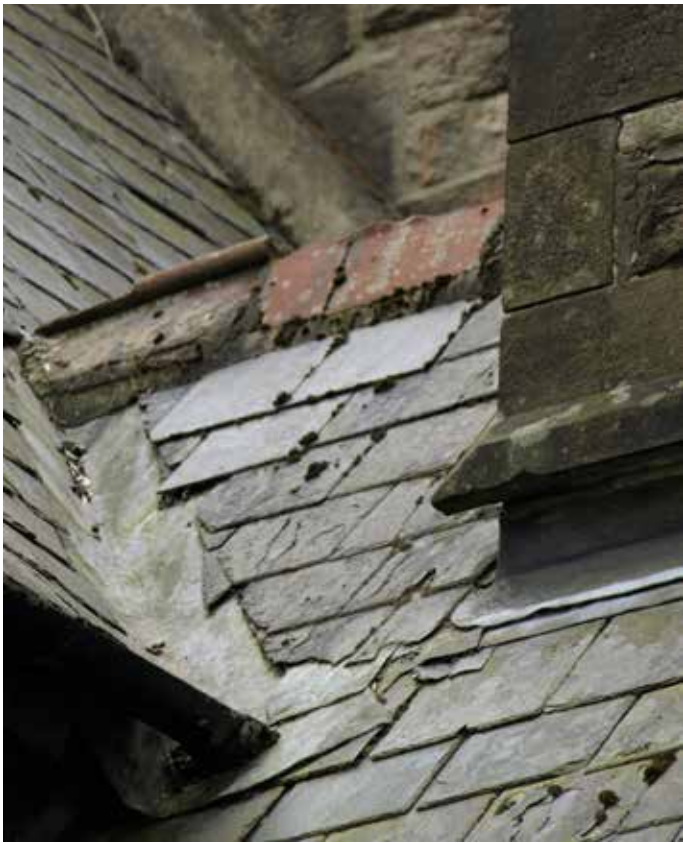
Vestry roof: broken & mismatched slates, broken ridge tiles

with the nave is cracked. Again the lead work to the abutment cannot be fully inspected as it is covered with cement. Water ingress here may be contributing to the masonry problems within the Porch.