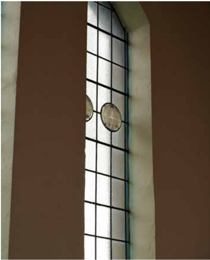
Incongruous plastic vents detract from the windows and should be removed