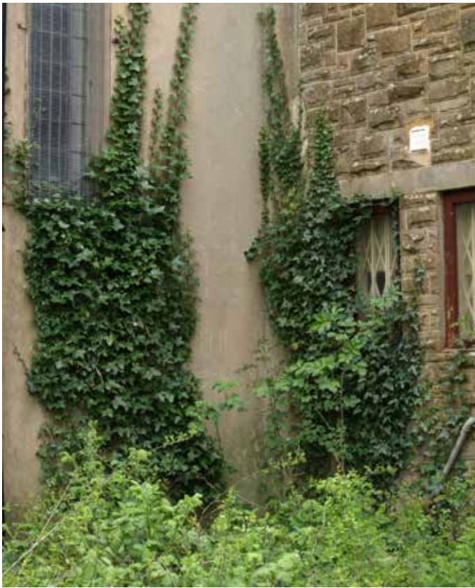
Encroaching vegetation holds dampness against the building, as well as causing mechanical damage to surfaces

It is recommended that an investment of time is made into understanding the drainage system - a camera survey of foul drains should be undertaken, the location of surface water drains traced by use of a scanner and sonde, and a drainage plan drawn up.