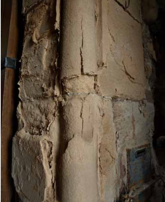
Porch: loss of sandstone surface due to water ingress and subsequent stone decay. All loose stone should be brushed off.