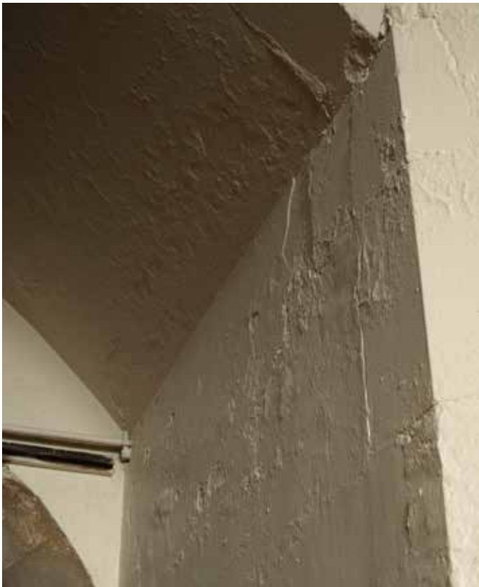
In places the surface finishes need to be stripped back to sound material and started again

There is a hatch access above the extension with a folding ladder allowing storage within the roof space - this is boarded out and used for storage of a few items. The junction between the existing external wall of the Nave and the new masonry is not bonded or sealed and there is clear daylight visible at the junction of the new wall to the old. This does not, however, appear to be causing an issue and the space appears dry. There is an area of former water ingress and staining on the floor and opening up within the ceiling, but it is believed that this has now been fixed, and appeared dry at the time of inspection.