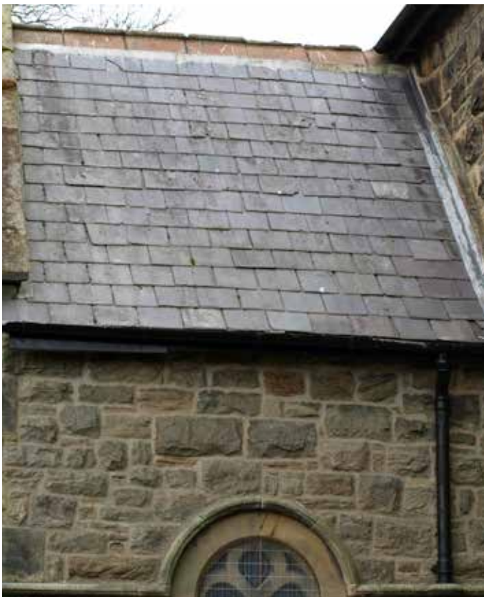
Porch roof: numerous slipped, broken and uneven slates