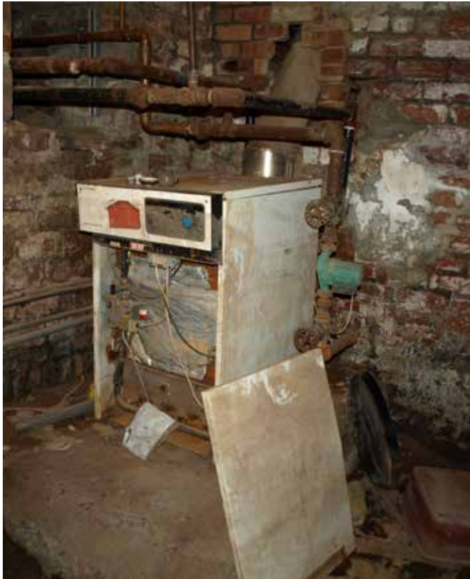
The aged gas boiler installation. Pipework should be lagged.