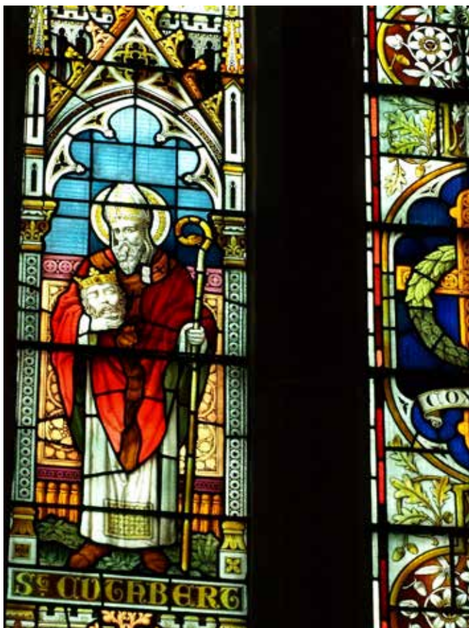
East window: St Cuthbert professionally repaired

In the Nave windows there are round plastic vents set within the leading, to give cross ventilation to the Church as there are no opening hopper windows. These plastic vents are rather crude and all appear to be closed. They should be removed and the glass made good. Other draughts and openings of doors may be deemed sufficient for the lofty Nave.