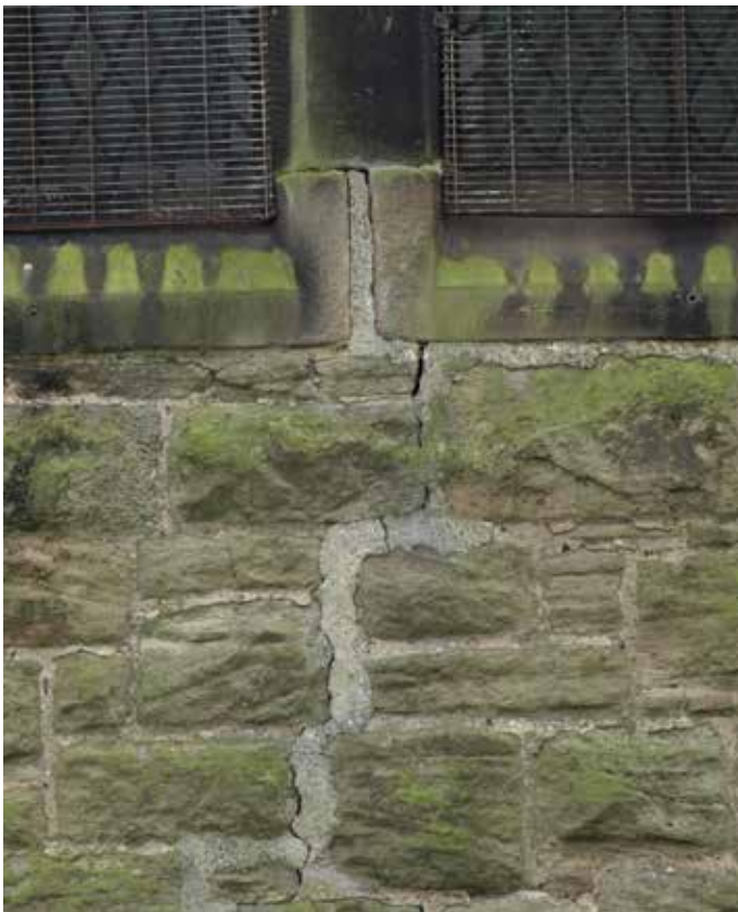
Vestry gable: cracks below the window need to be repointed