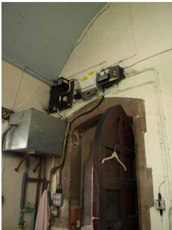
Vestry: note historic cracking at the angle of the ceiling

The Vestry is accessed from the north side of the Chancel and is part of the original construction. The walls are plastered and painted and showing signs of peeling in various areas. This is due to damp masonry, pointed in cement externally and vinyl paint internally, which is now flaking and peeling.