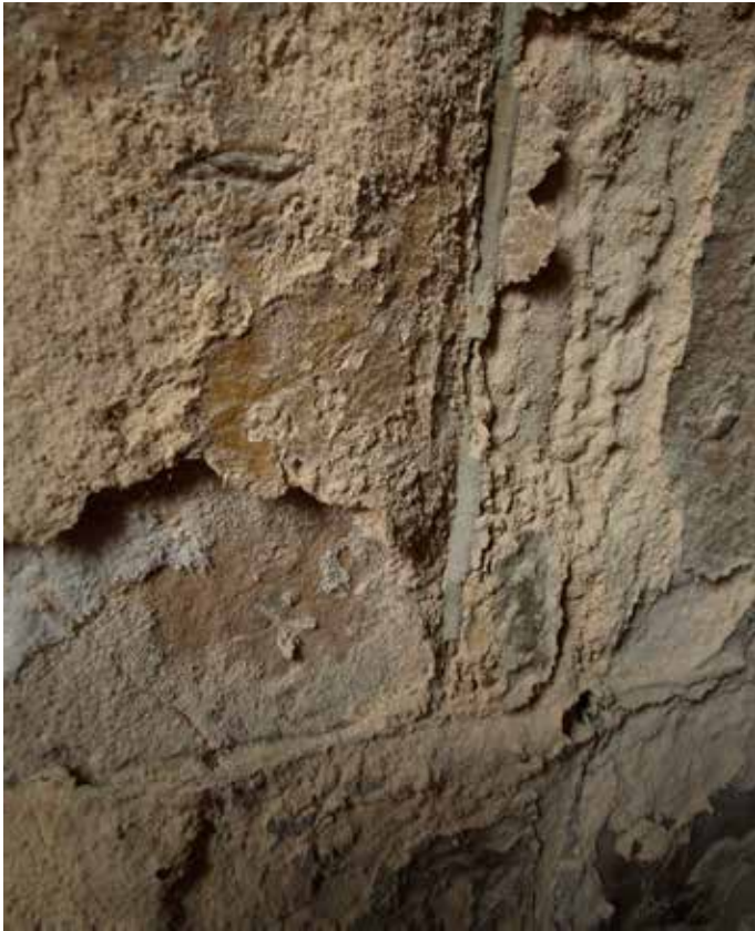
Porch: decay of the sandstone reveal to the doorway

The walls of the Porch should be brushed down with a stiff brush to remove the friable stone. This will then allow the rate of decay to be monitored. A lime shelter-coat could be considered to reduce the rate of stone decay, but efforts should focus on the elimination of sources of water ingress. The internal faces of the walls in the Nave and Chancel are in reasonable condition, although there are a few areas where salt damage is evident. This deterioration from salts appears