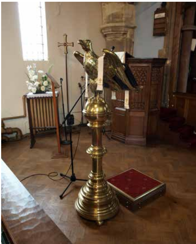
High quality fittings and fixtures against a backdrop of failing plaster and bubbling paint

The raised timber stalls for the choir appear in good condition.