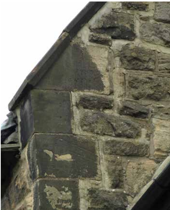
Kneeler to Nave: outward displacement. Coping above has been badly bedded and is misaligned. Numerous open joints.

The joints of the watertabling to the north side of the Nave west gable are open. Quite a number of the stones are broken or split.