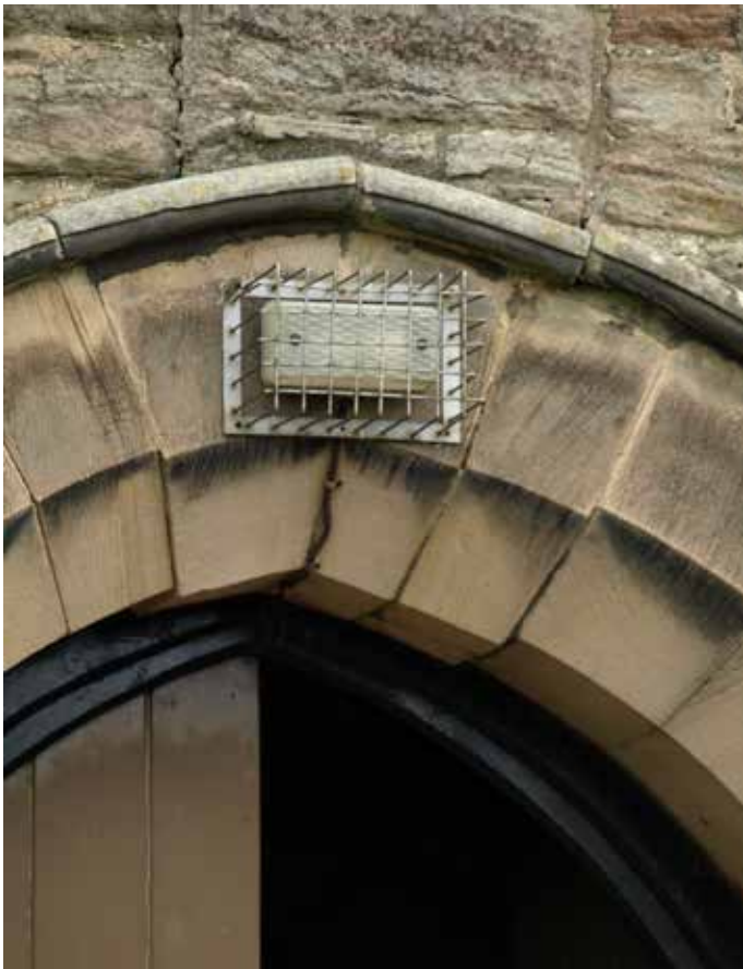
Porch gable: displaced voussoirs and open joints due to settlement, probably soon after construction.