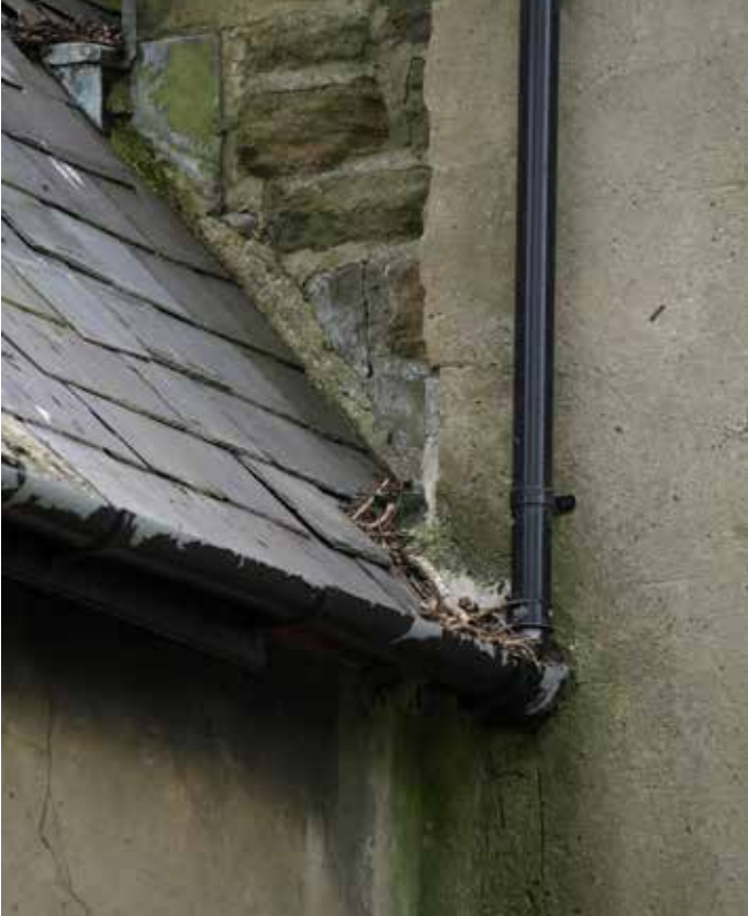
Gutter cleaning is needed frequently