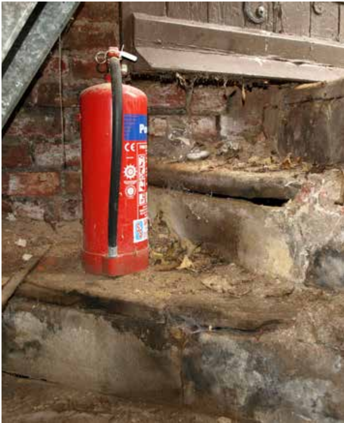
Fire equipment is regularly serviced. A wall bracket is recommended

There have been no asbestos surveys and therefore it is not known whether there is any asbestos present. Typically asbestos is associated with heating installations and organ blowers. An Asbestos Management survey should be commissioned.