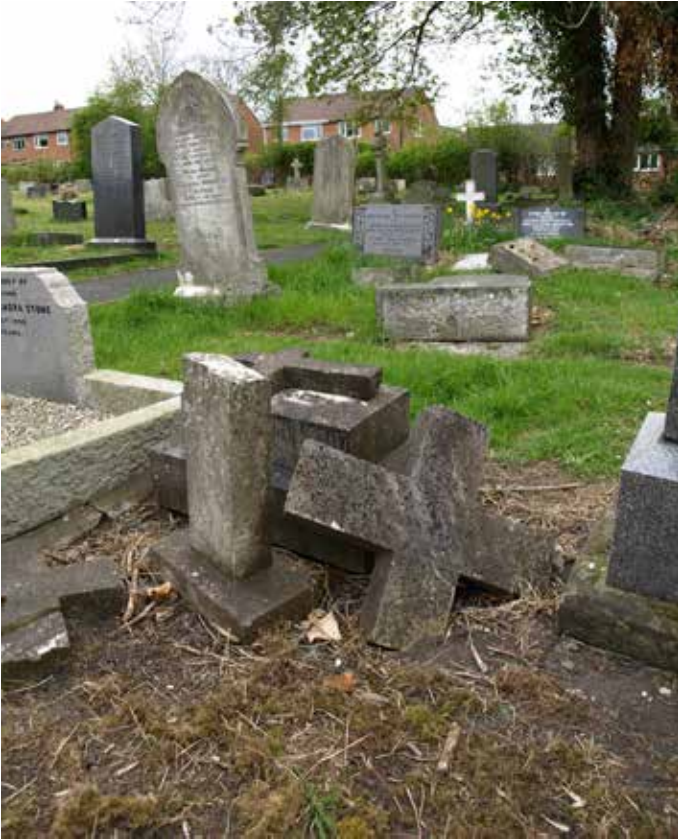
Damaged monuments and gravestones contribute to the air of neglect.