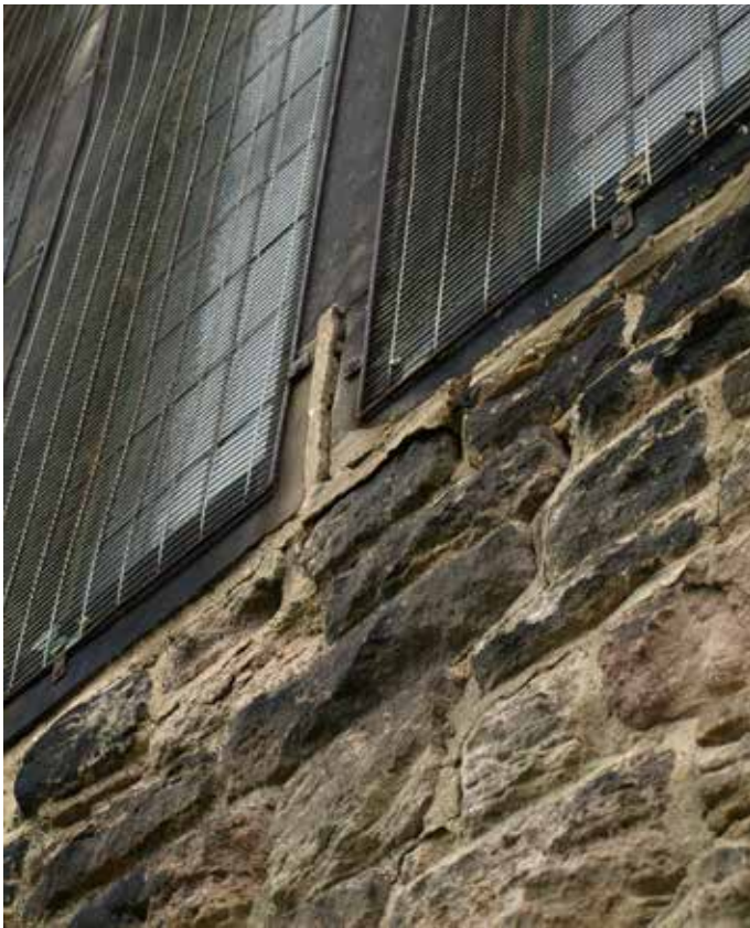
Pointing in very poor condition below the west window

The windows of the new extension are timber framed, of rather poor quality, with polycarbonate glazing instead of glass, with metal grilles on the inside. The cills and lower rails of the casements are starting to decay and should be repaired.