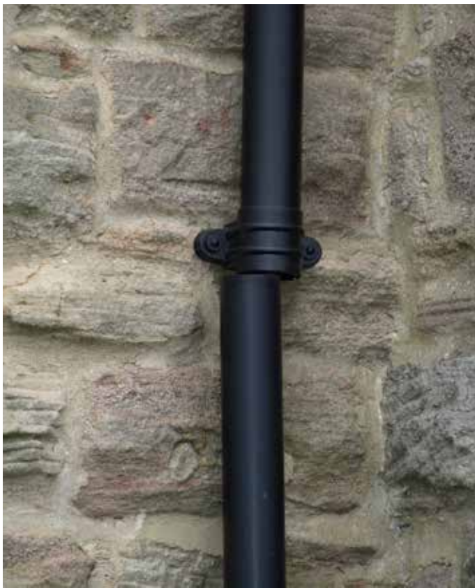
Nave south elevation: plastic rainwater pipe with failed fixings