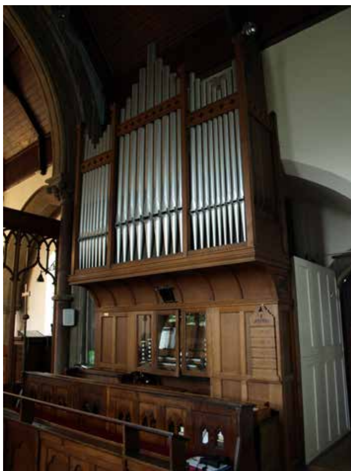
Organ in excellent condition

There is a painting fixed to the wall over the children's area which appears to be secure.