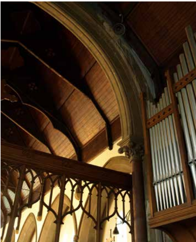
The church is notable for its high quality furniture and rood screen.