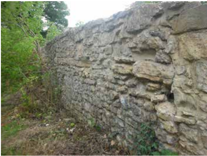
Southern boundary wall is soft carboniferous limestone which is being severely damaged by the cement pointing

limestone that is now in a fairly deteriorated state having been pointed in cement.