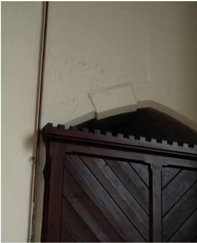
Porch draught screen & historic slipped voussoir above