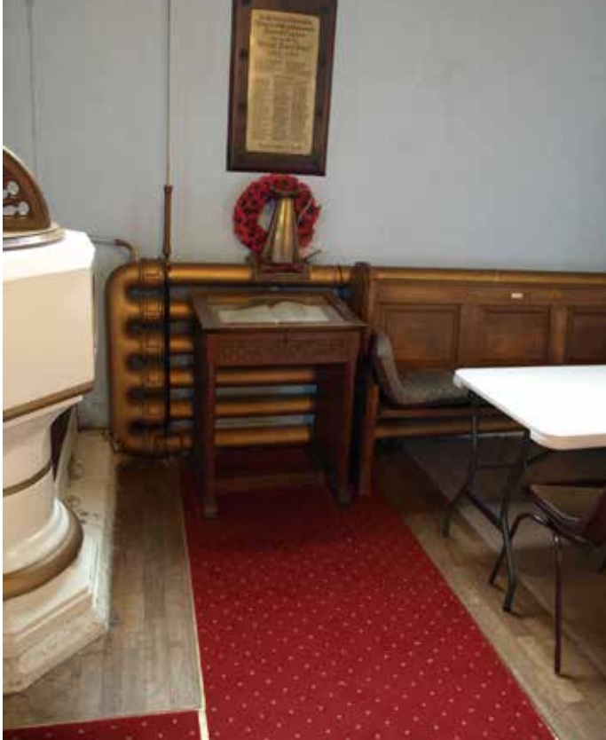
The heating system has a certain industrial charm, but it neither efficient nor economical to run