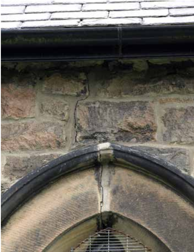
Minor cracks around features should be repointed so that their future movement can be easily detected.

to the soft ground conditions in this area, and the amount of vegetation which may be undermining foundations.