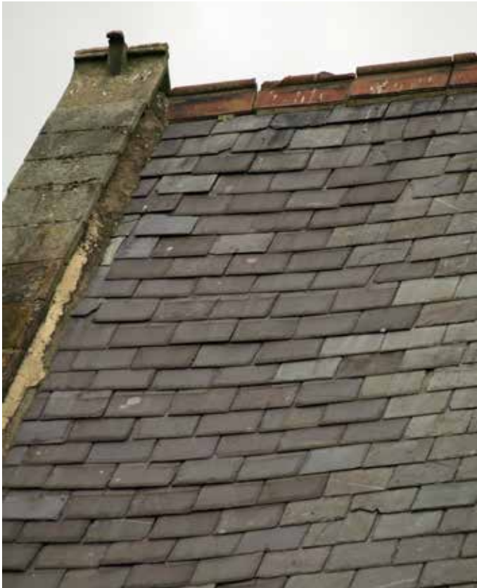
Poorly matched and laid slates, with many broken or slipped. Ridge tiles broken and poorly bedded and pointed.

The Porch roof remains in very poor condition, again with many broken and replacement slates, notably worse on the west elevation pitch. The ridge tiles are broken, ridge pointing loose and falling away, and the cement fillet to the abutment