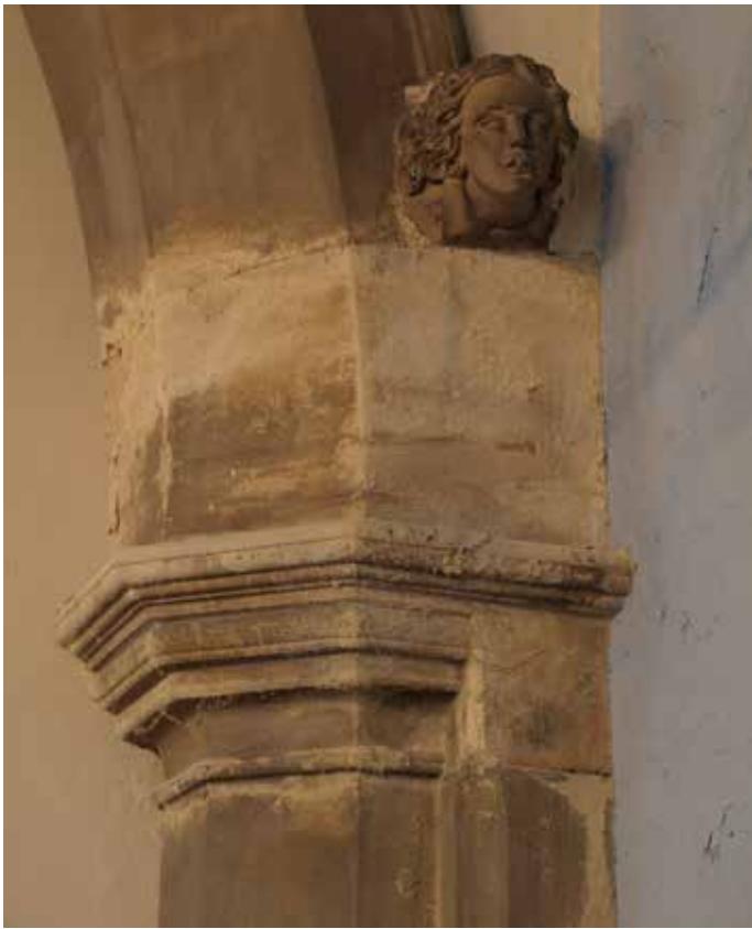
Stone decay to capital of Arcade due to historic water ingress, now drying out