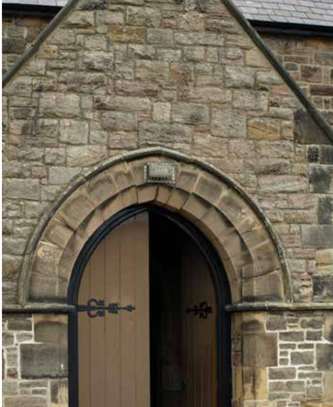
Porch doorway, with dropped voussoirs

The soft clay ground conditions are most probably contributing to ground movement around the 1980s extension. This is causing settlement and substantial cracking in the masonry of the extension, made worse by its construction in a cementitious mortar rather than a more flexible lime mortar.