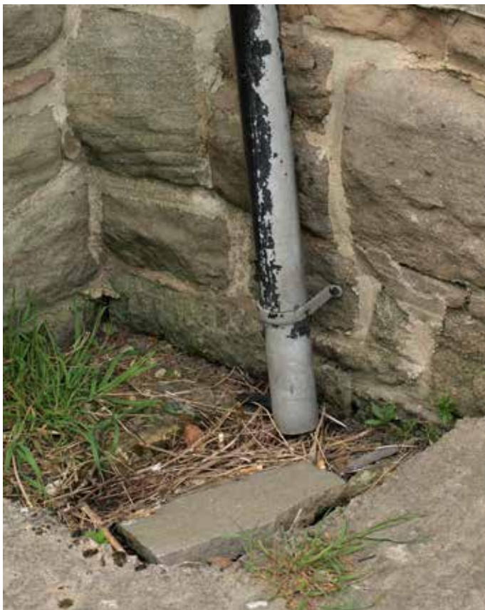
Plastic rainwater pipe with failing paint & rusting fixings, gully clogged with debris.