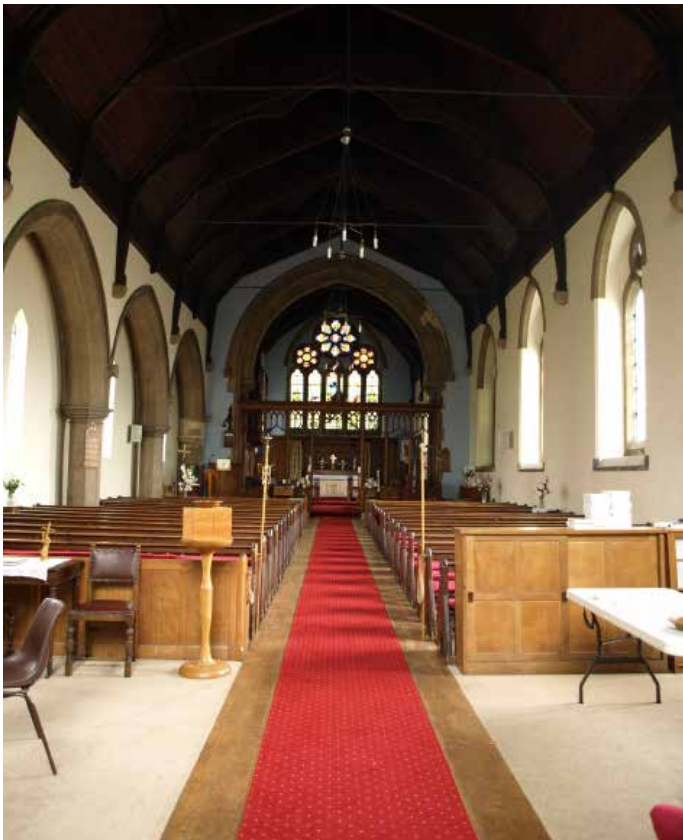
View from Nave to Chancel

The sealants and masonry paints that have been recently used to try and combat some of the damp issues will only serve to exacerbate the situation. It is important that any materials applied to the building are breathable to ensure that moisture