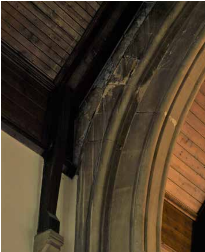
Chancel arch: historic water staining due to water ingress at copings or flashings above

The floor area to the west of the Nave is mostly carpeted and appears in reasonable condition. The woodblock floor down the central aisle, at the front of the pews, and also in the Chancel is all in excellent condition. A note must be made that woodblock floors should not be mopped with a wet mop, but scrubbed by hand with little water, and should be treated with oil rather than varnish. There are some areas of loose woodblock near the Vestry door that require re-fixing, and also in the Nave at north side near the front.