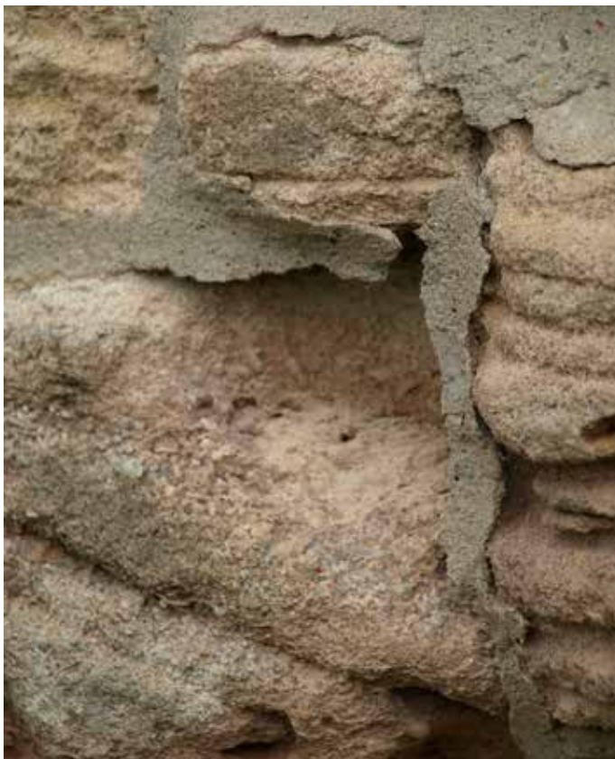
Hard cement pointing causes accelerated decay of soft sandstone. Only soft lime mortar should be used on traditional stonework