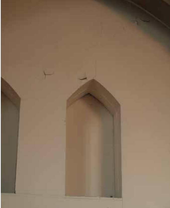
Surface damage at the abutment of the extension; dry at time of inspection