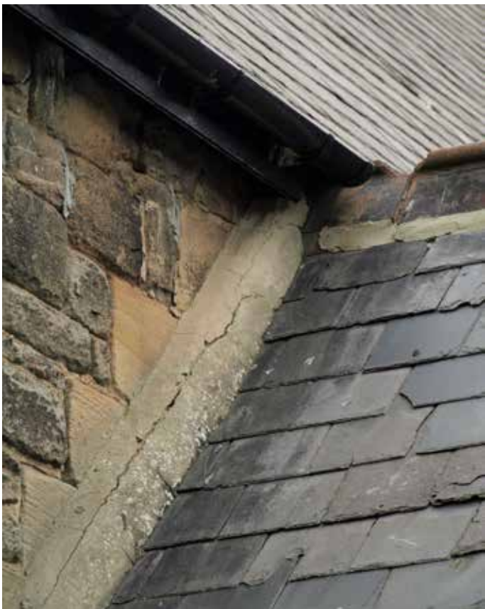
Abutment of Porch roof: cracked mortar fillet, cracked & broken slates, artificial slates incorrectly fixed

All areas of greenery indicate prolonged areas of damp which show leaking downpipes, leaking outlets, or leaking gutters.