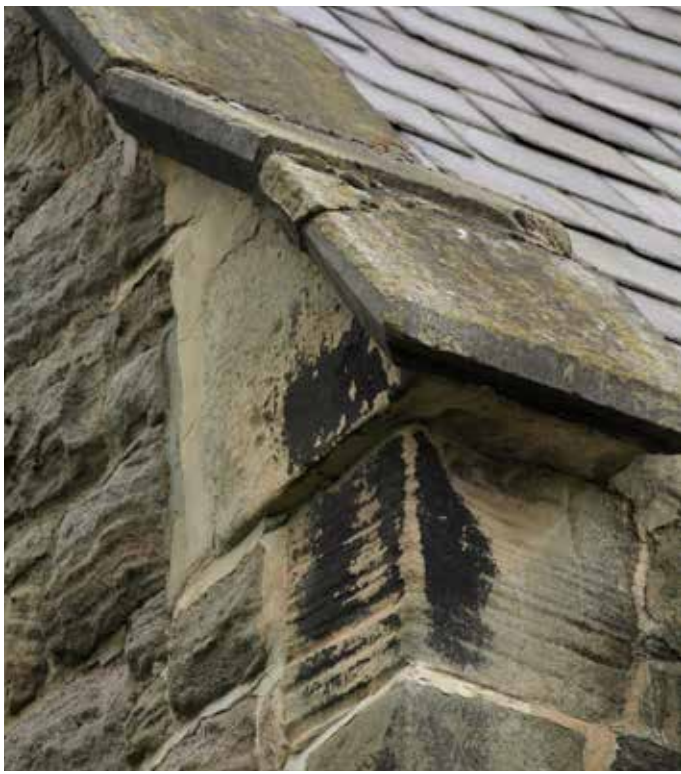
Nave south-west kneeler: rebuilt with very poor alignment. Needs to be re-built.