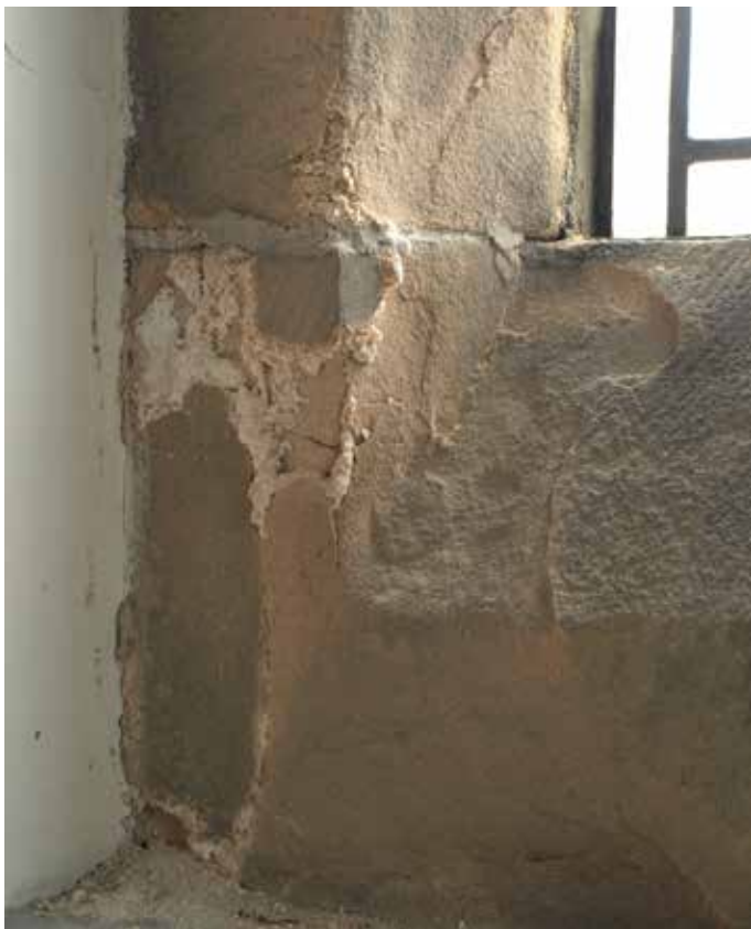
Window sIII: stone decay of cill due to water ingress at joints

to be more pronounced on the brick north wall, set behind the arcading.