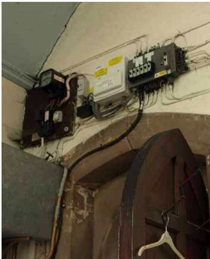
Much of the electrical installation is of a considerable age, but remains serviceable